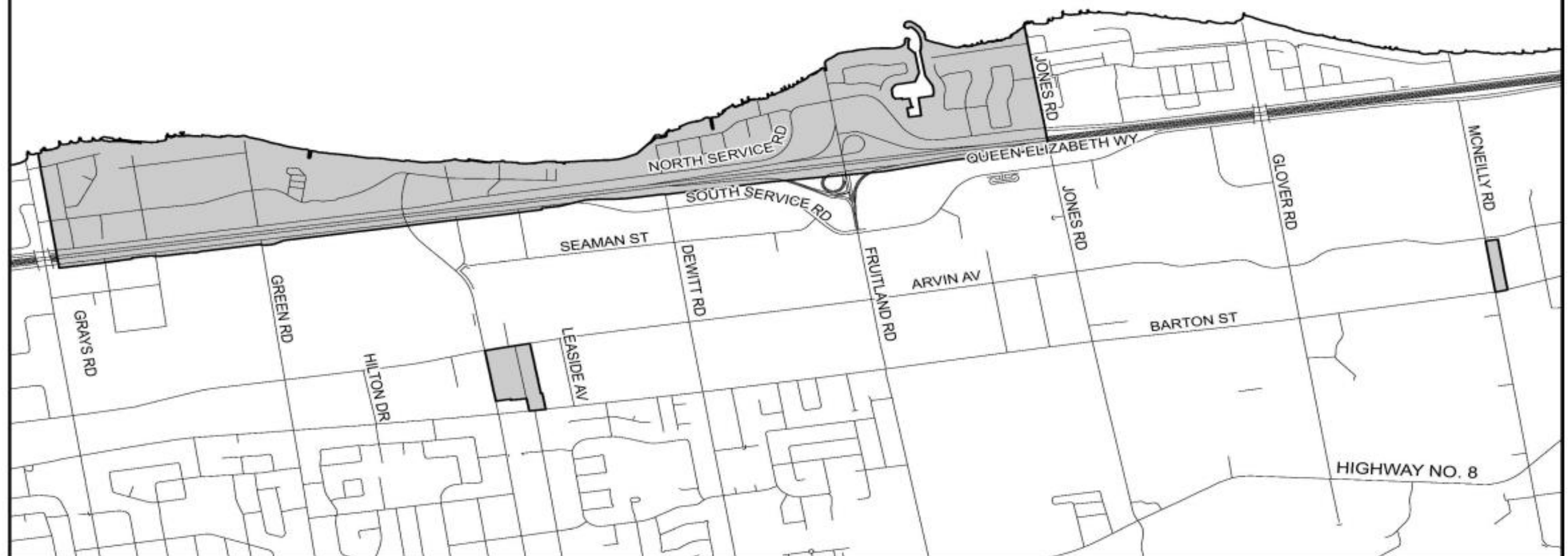
Special Figure 1: Additional Permissions in Low Density Residential Zones Outside of Secondary Plans